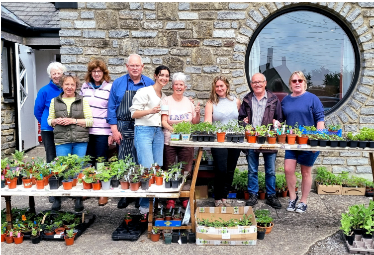
and the helpers